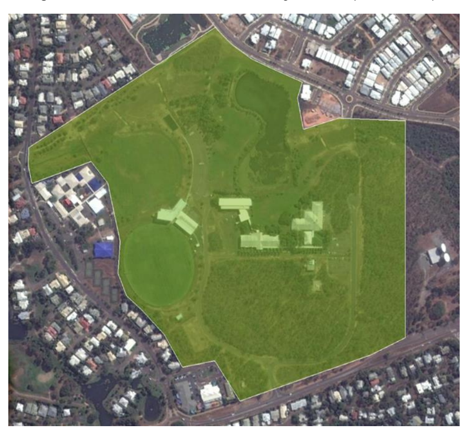
Figure 1: Charles Darwin University Palmerston campus (indicating site extent and boundaries).