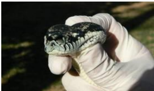
Figure 4: The head of a carpet python restrained using a three finger hold.

This method is suitable for small to medium mammals, reptiles and birds. It is used to restrain the head of an animal. The thumb and middle finger are placed on either side of the animal's head and the index finger placed on top of the head.