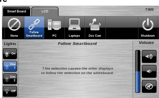
Blue 2.1.50 Conference Room Page | 2