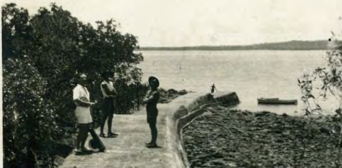
The landing at the Channel Island quarantine station, which housed Australia's first infected case